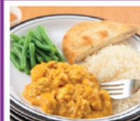
Mild Chicken Curry served with Rice, Naan Bread & Seasonal Vegetables