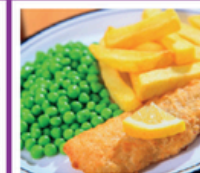
Battered Fish served with Chips, Baked Beans or Peas