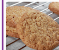
Rice Crispy Cookie

For allergen information, please ask one of our catering team • All the above dishes are subject to availability