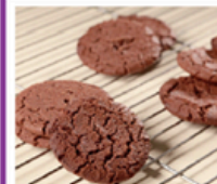
Chocolate Mudslide Cookie