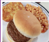
Beef Burger in a Bun, Hash Brown served with Baked Beans or Seasonal Vegetables