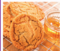
Golden Crunch Biscuit