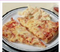
2 Slices of Margherita Pizza (V) served with Baked Beans, Seasonal Vegetables or Coleswal