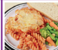
3 Cheese & Tomato Pasta (V) served with Crusty Bread & Seasonal Vegetables