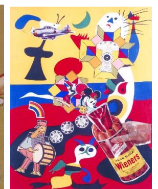
Sack-O- Sauce (1948)