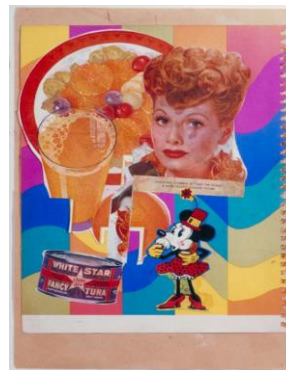
Meet The People (1948)