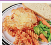
3 Cheese & Tomato Pasta (V) served with Crusty Bread & Seasonal Vegetables