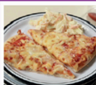
2 Slices of Margherita Pizza (V) served with Baked Beans, Seasonal Vegetables or Coleslaw