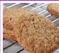
Rice Crispy Cookie