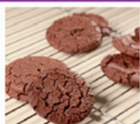
Chocolate Mudslide Cookie