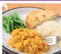
Mild Chicken Curry served with Rice, Naan Bread & Seasonal Vegetables