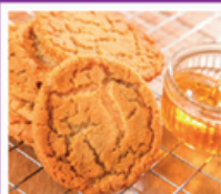
Golden Crunch Biscuit