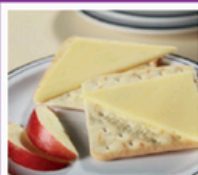
Cheese & Crackers