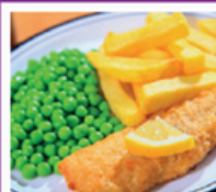
Battered Fish served with Chips, Baked Beans or Peas