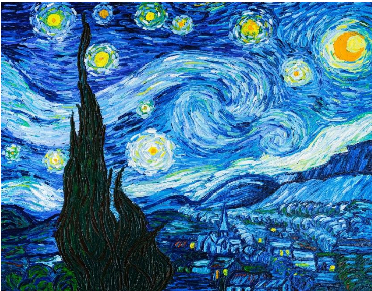
'The Starry Night' was created by Vincent Van Gogh using oil paints in 1889.