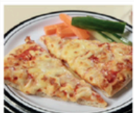
2 Slices of Thin & Crispy Cheese & Tomato Pizza (V), served with Baked Beans, Seasonal Vegetables or Colestlaw