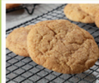
Snicker Doodle Biscuit

FRESHLY MADE SALAD FRESH BREAD FRUIT YOGHURT FRESH FRUIT CHILLED WATER