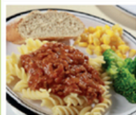
Pasta Bolognese served with Crusty Bread & Seasonal Vegetables