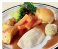
Roast Chicken Lunch served Roast/Mashed Potatoes, Seasonal Vegetables & Gravy