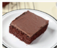
Iced Wacky Chocolate Cake