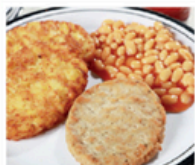
Sausage Pattie Brunch served with Hash Browns & Baked Beans