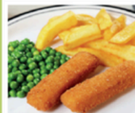
Cod/Salmon Fish Fingers served with Chips, Baked Beans or Peas