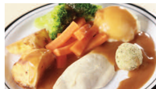
Roast Chicken served with Roast/Mashed Potatoes, Seasonal Vegetables & Gravy