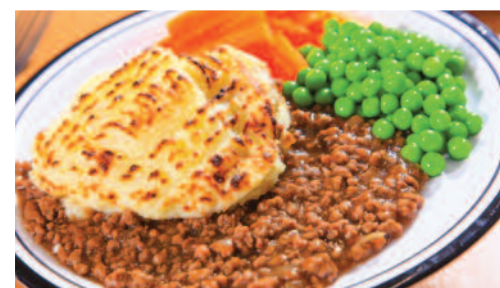
Cottage Pie served with Seasonal Vegetables