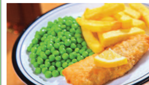
Battered Fish (MSC) served with Chips & Peas or Baked Beans