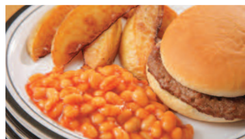
Beef Burger served in a Bun with Potato Wedges & Seasonal Vegetables or Baked Beans