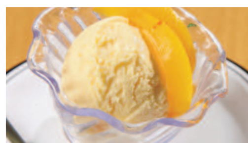
Ice Cream & Fruit