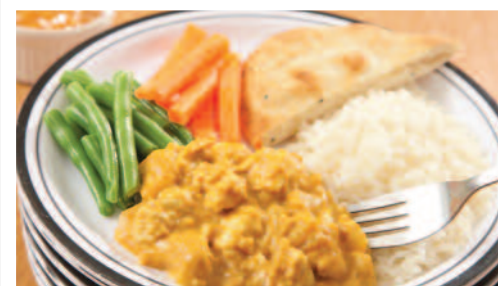
Chicken Korma served with Rice, Naan Bread & Seasonal Vegetables