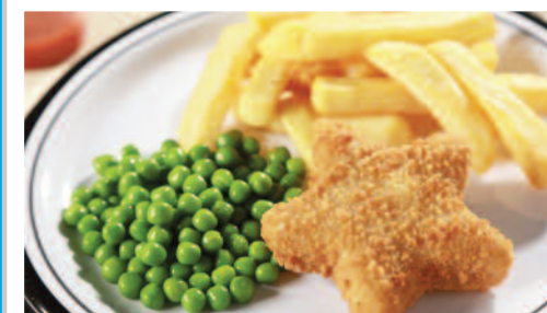
Fish Star (MSC) served with Chips & Peas or Baked Beans