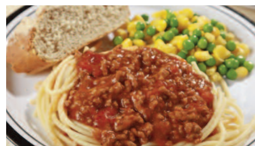
Spaghetti Bolognese served with Garlic & Herb Bread and Seasonal Vegetables