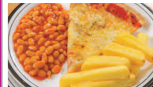
Cheese & Tomato Pizza served with Chips & Peas or Baked Beans