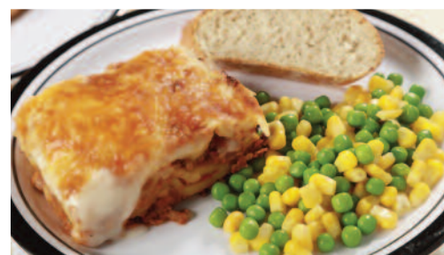
Beef Lasagne served with Garlic & Herb Bread and Seasonal Vegetables