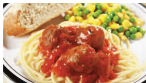
Meatballs in Tomato Sauce served with Spaghetti, Garlic & Herb Bread and Seasonal Vegetables