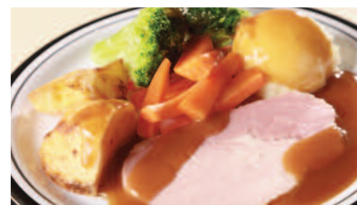
Honey Roast Gammon served with Roast/Mashed Potatoes, Seasonal Vegetables & Gravy