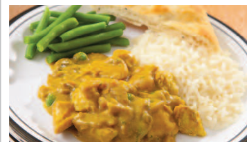
Chinese Chicken Curry served with Rice, Naan Bread & Seasonal Vegetables