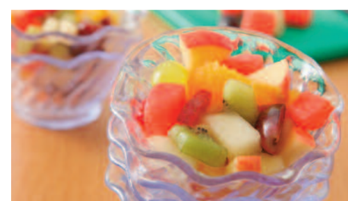
Fresh Fruit Salad