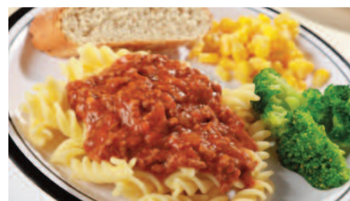
Pasta Bolognese served with Garlic & Herb Bread and Seasonal Vegetables