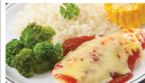
BBQ Chicken served with Savoury Rice and Seasonal Vegetables