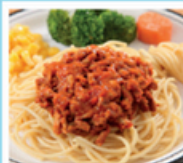
Spaghetti Bolognese served with Seasonal Vegetables