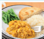
Mild Chicken Curry served with Rice, Naan Bread & Seasonal Vegetables