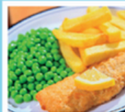
Battered Fish served with Chips, Baked Beans or Peas