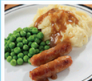
Sausages served with Mashed Potato, Gravy & Seasonal Vegetables