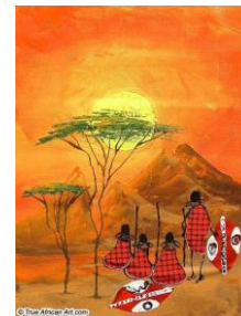
In the morning